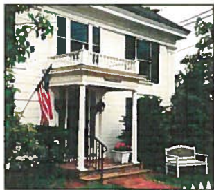
The original building, constructed in 1820.

Many years later, the Brenner's saw a need within the surrounding communities to offer its services to a larger