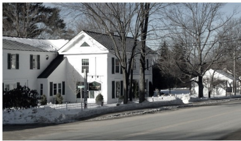
Top: Whipple House circa 1910