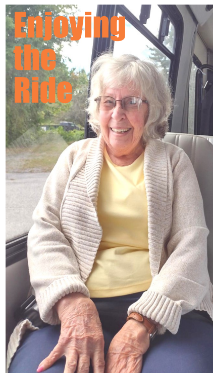
Enjoying the Ride