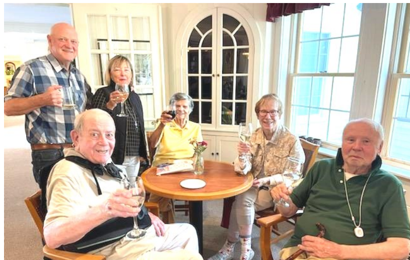
Good Times @ Waldo's Pub !