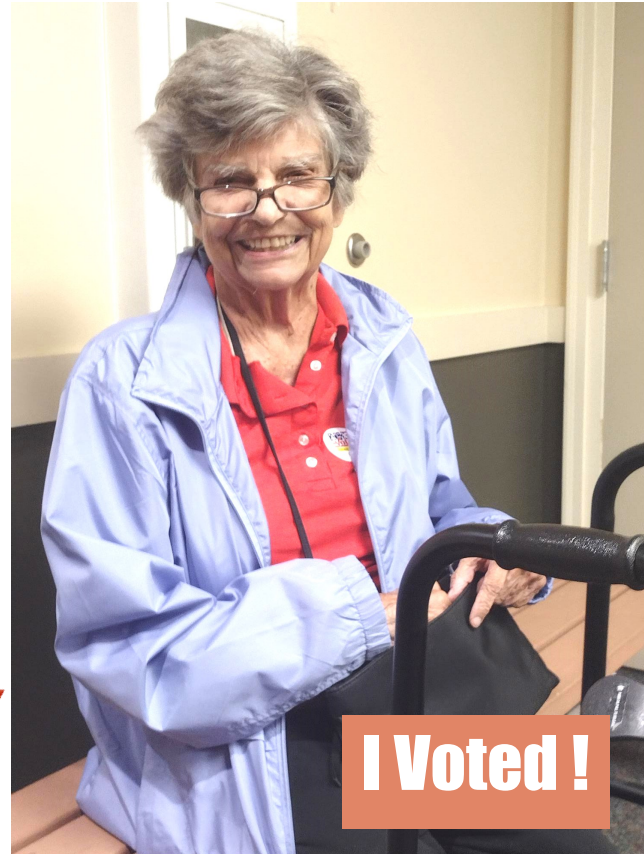
I Voted !