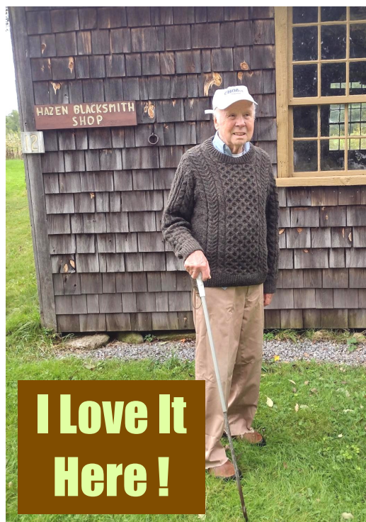
I Love It Here !