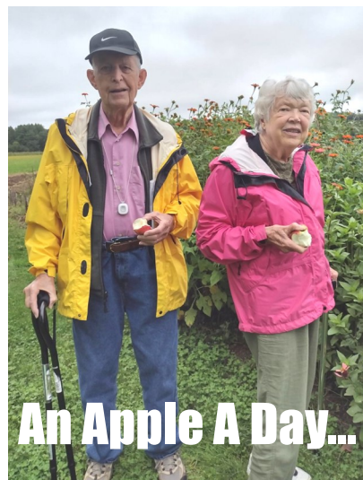
An Apple A Day...