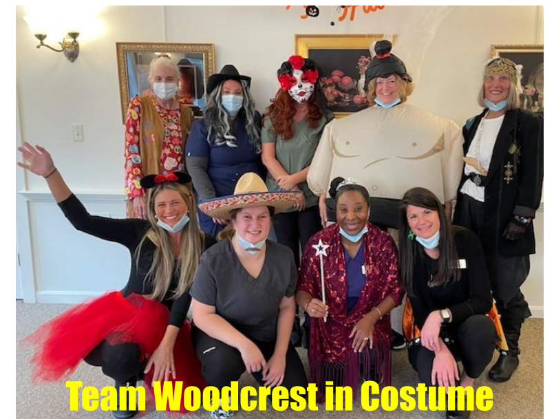
Team Woodcrest in Costume