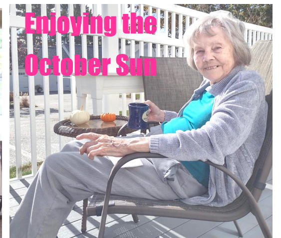
Enjoying the October Sun