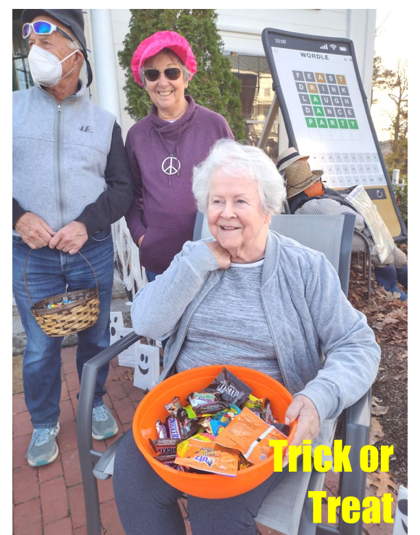
Trick or Treat