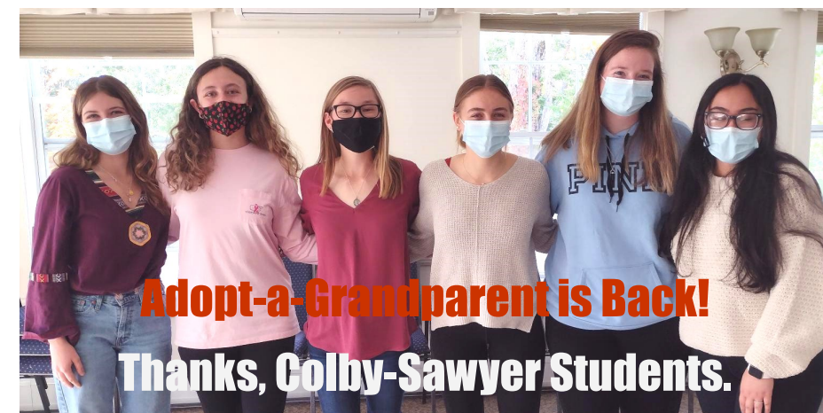
Adopt-a-Grandparent is Back! Thanks, Colby-Sawyer Students.