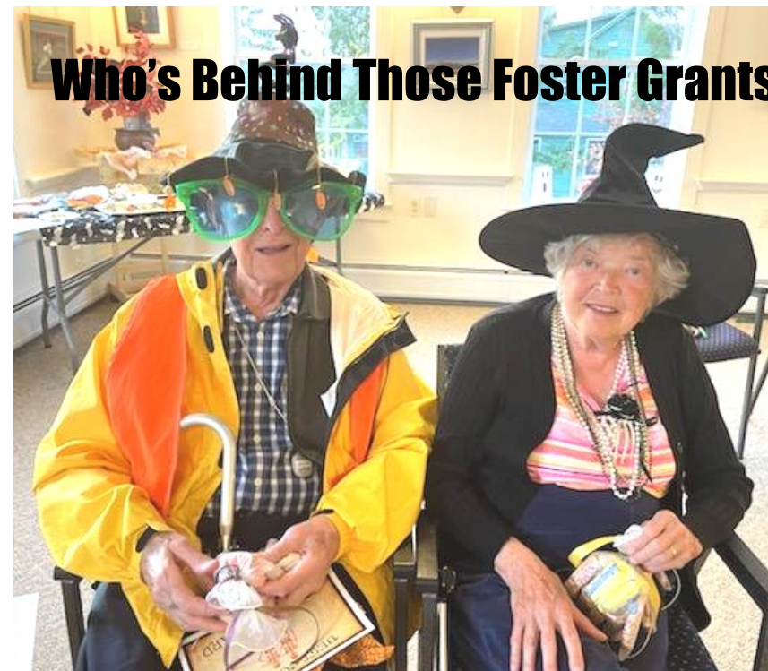
Who's Behind Those Foster Grants