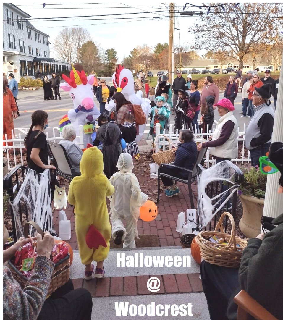
Halloween @ Woodcrest