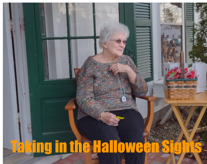
Taking in the Halloween Sights